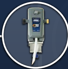
Dedicated Single Dispenser