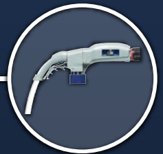
Portable Trigger Dispenser